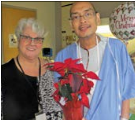
St. Paul's Hospital