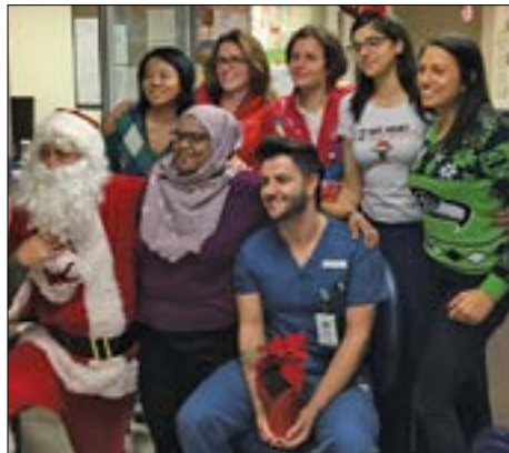
Royal Columbian Hospital