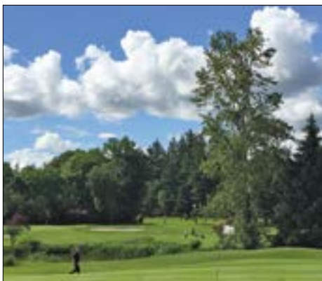
Poppy Estate Golf Course is located in a picturesque rural setting in the beautiful Fraser Valley just off Fraser Highway in Aldergrove, BC.

If you have any questions please call me (Roger Kocheff) at 604-467-2904 or email me at: rkocheff@telus.net